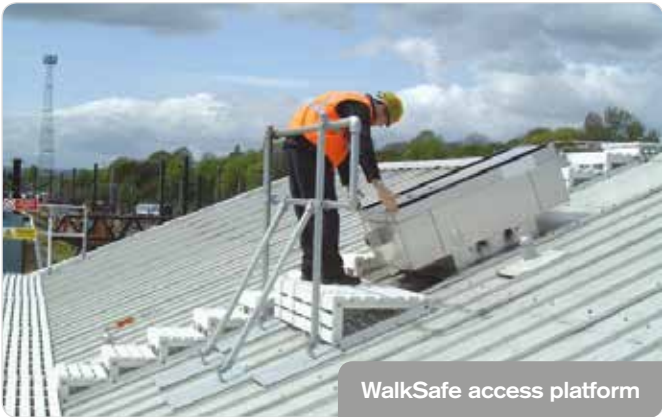
WalkSafe access platform