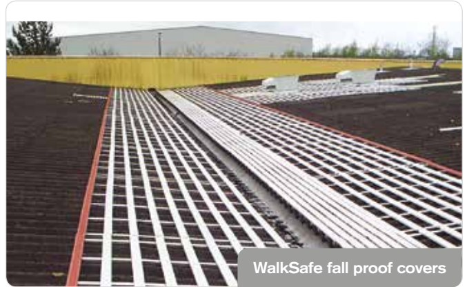
WalkSafe fall proof covers