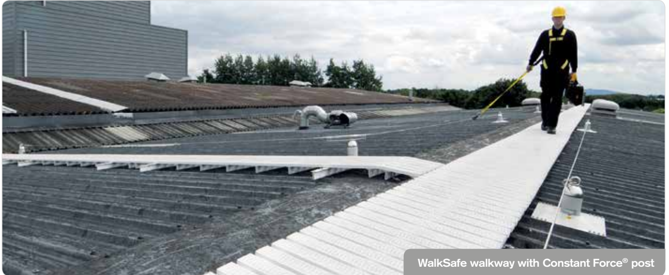
WalkSafe walkway with Constant Force® post

In nearly all instances it is impractical to prevent roof access, therefore the ideal solution is to create a level surface with all fall hazards protected against. WalkSafe® is a range of walkways and fall proof covers which can provide a designated safe access route, guiding a workers' movement in areas where there are potential fall hazards or fragile surfaces.