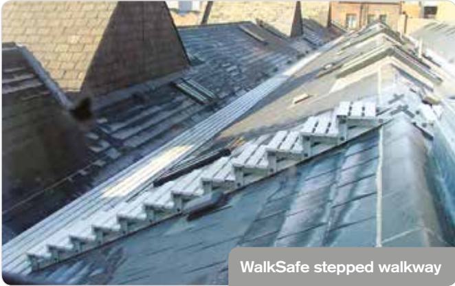
WalkSafe stepped walkway