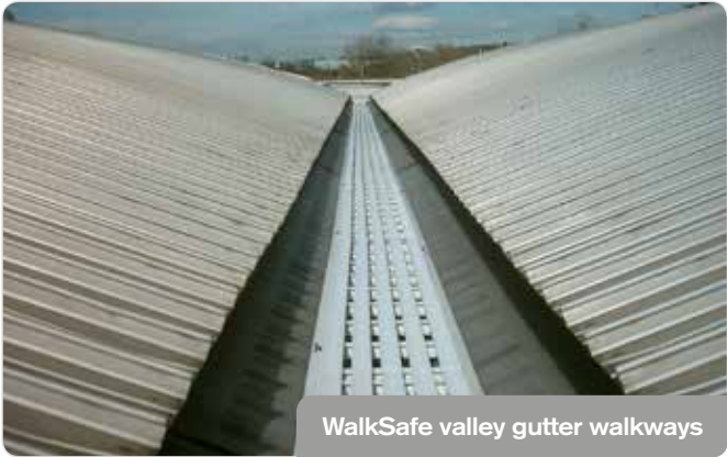
WalkSafe valley gutter walkways