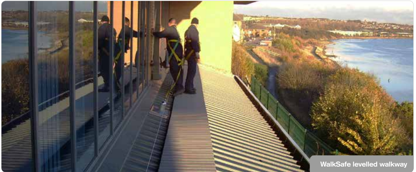
WalkSafe levelled walkway

Manufactured from recycled PVCu, all WalkSafe products have an anti-slip surface and are a lightweight, practical solution which can be easily installed to replace existing wooden duckboards, scaffolding boards. Additionally, WalkSafe systems are ideal to be used in conjunction with collective fall protection and personal fall protection systems, such as Latchways' VersiRail guardrail or a Constant Force post cable systems.