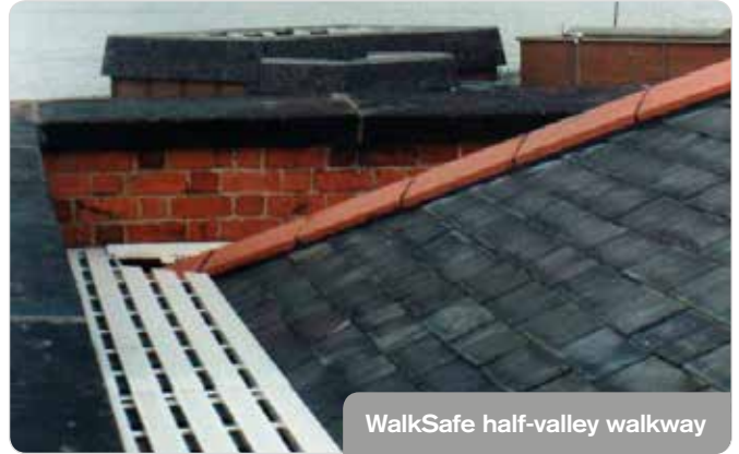
WalkSafe half-valley walkway